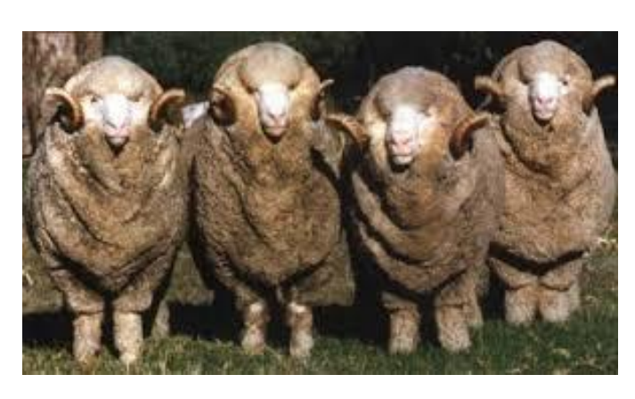
Merinos - the cause of all the commotion

the industry was heading. He spoke of black fibre as undesirable as it devalued the fleece.