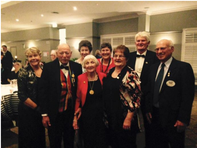
RCFV Members attending Toowong's 50th Gala Dinner