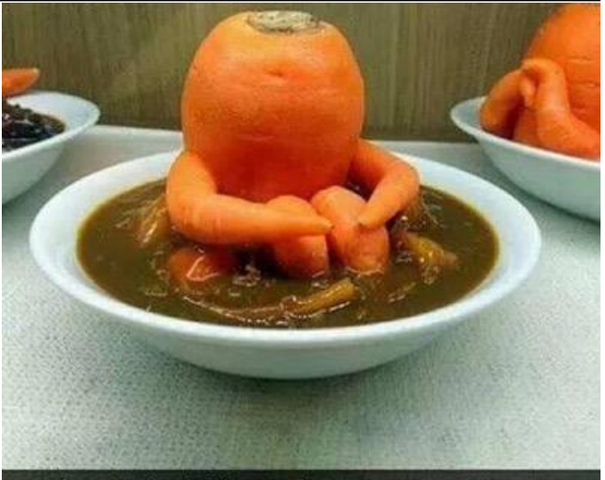
After stewing in his emotions, emo veg comes to the conclusion that the root of the world's problems is that people don't seem to carrot all...