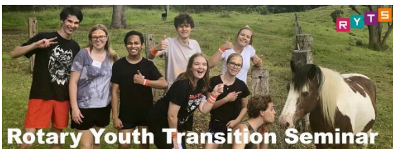
Rotary Youth Transition Seminar

Very quiet on the youth front at the moment, as always though we are on the lookout for future awardees to attend Rotary camps. We have RYTS (Rotary Youth Transition Seminar) coming up in November. RYTS is a 6 day residential camp for students aged 16-18 years. The camp is aimed at developing leadership and life skills as student's transition into adulthood and life after school. Dates: Sunday 17/11/2019 to Friday 22/11/2019. Applications close Sunday 10 th November, contact any of our club members for more details or go to https://www.rotary9640.org/page/ryts