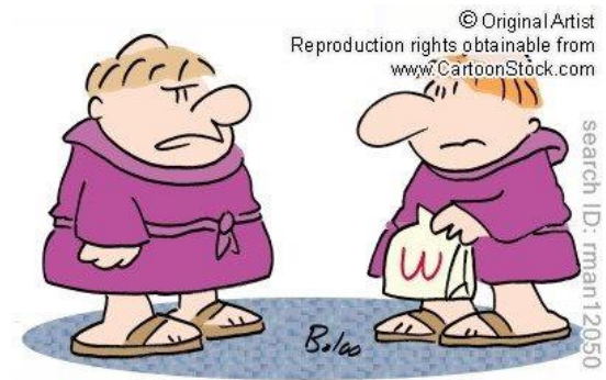
"'Fasting' doesn't mean eating fast food!"

Why do banks leave vault doors open and then chain the pens to the counters.